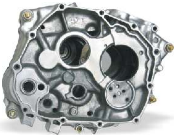
Crank Case for 125cc Motor Cycle