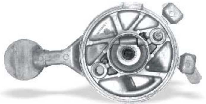
Front Wheel Brake Panel