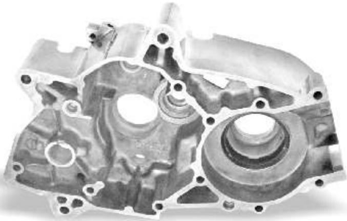
Crank Case for 100cc Motor Cycle