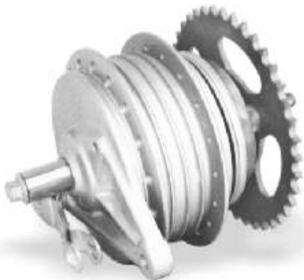
Rear Wheel Hub Set