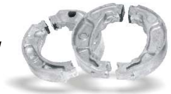
Brake Shoe Body