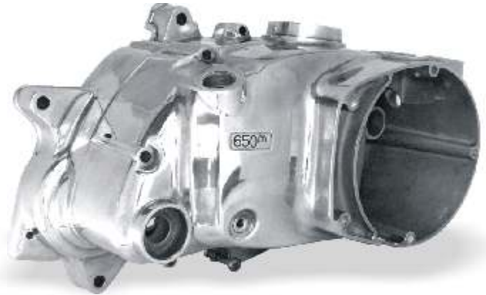
Clutch Cover for 100cc Motor Cycle