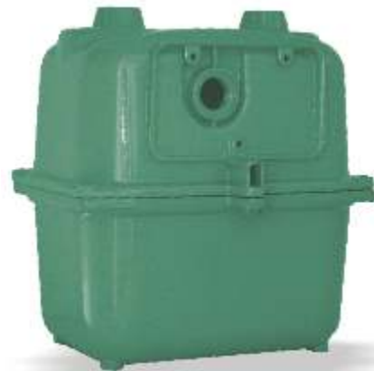
Natural Gas Meter Housing (High Consumption)

A different variety of surface finishes are available to our customer, using the very best of material and modern process an appealing and durable finish is ensured.