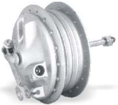
Front Wheel Hub Set