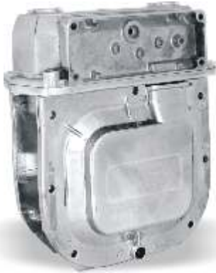
Natural Gas Meter Housing (Low Consumption)